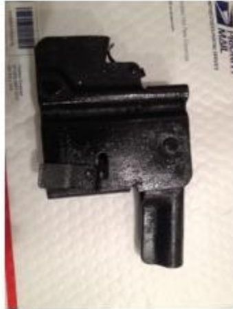
1957 Thunderbird Bumper Jack Ratchet Only